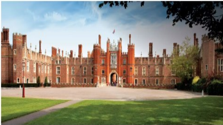
Hampton Court Maths Challenge